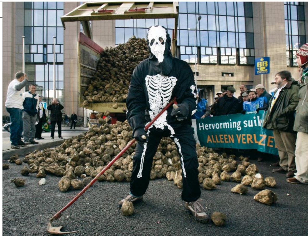
Death of the sugar industry? Brussels insists that the reform is essential for its survival