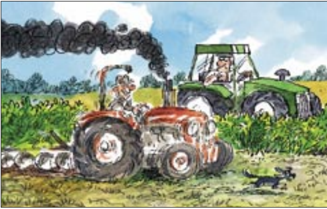
From 2007 to 2014, new machines will have to conform but not existing ones.

rough land or hauling trailers, can generate enough vibration to take the operator to the limit value inside an eight-hour stint.