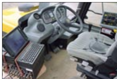
JCB had plenty of space for vibration-measuring equipment.

This variation is much bigger than the WBV emission differences between tractor suspension types – in the scheme of things, suspension's effect is relatively small. But springing definitely lowers WBV emission and boosts subjective ride comfort, so is one way forward. Yet even then operator choice adds more complication, as the reduction