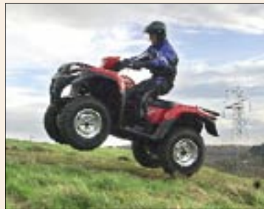
Hand-arm vibration on ATVs may be a factor.

What isn't clear is if (and how) these factors interact, and whether two or three bad jolts over a day's driving do more or less damage than a steady stream of small shocks. Nevertheless, whole-body vibration exposure is assessed through a dose approach, which is where possible working-hours limitation comes in.