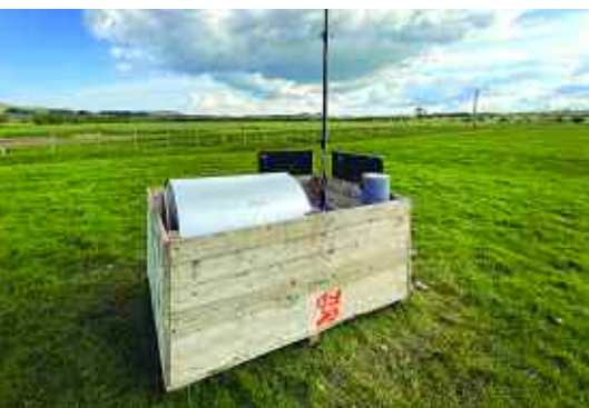
Skippy Nest is powered by solar panels and is air conditioned to stop overheating/freezing.