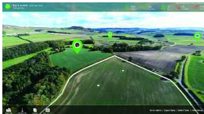
The Scouts Sphere update will enable users to capture a high-resolution whole field overview within 30 seconds.