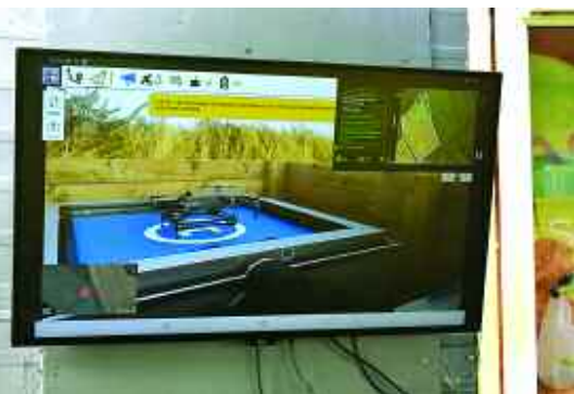
The Skippy Nest technology can provide a real-time view from anywhere in the world.

► at about 100m above ground — and enables the drone to take photos through a sphere in a similar way to taking a panoramic photo on your mobile.