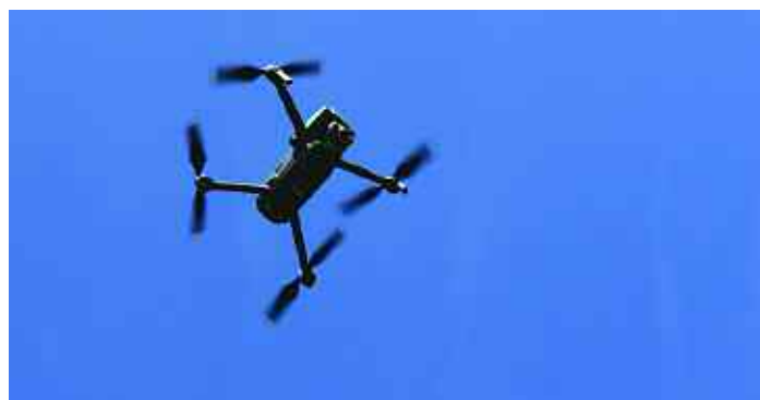
Flight 3.0 will enable users to scout a field in half the time of the 2.0 version.

And its these challenges which have led the firm to where they are today, he explains. "Over the past couple of months, we've built 'Scout Spheres' and essentially what this does is sends the drone to the centre of the field — flying ▶