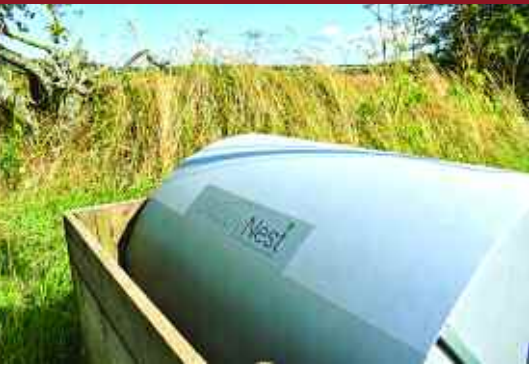
Skippy Nest is base station technology which will allow a drone to be flown from anywhere in the world – without the need for an operator in the field.